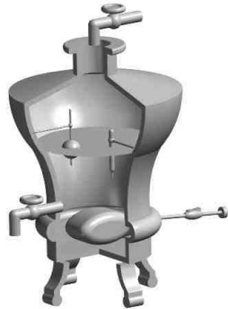
1. ábra. The coffee machine

The coffee machine is a tank with a built-in on-off electrical heater. The water is fed to the tank from the tap controlled by a binary switch. The hot water flows out from the tank controlled by another binary switch.